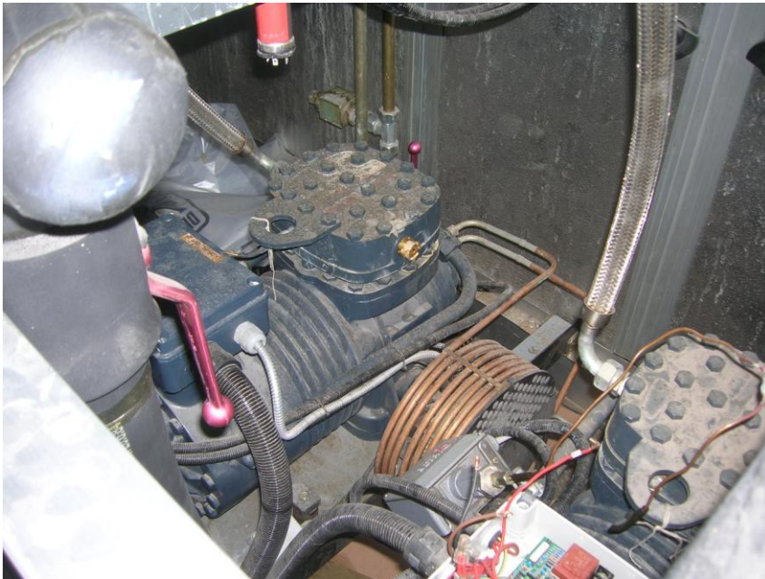
City Linthout (2006)