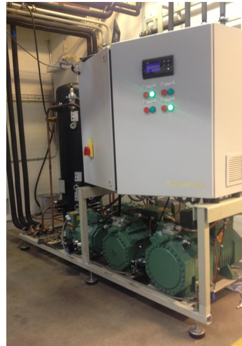
40+10 kW with CO2 MT and LT dual temperature Max 5 compressors per unit