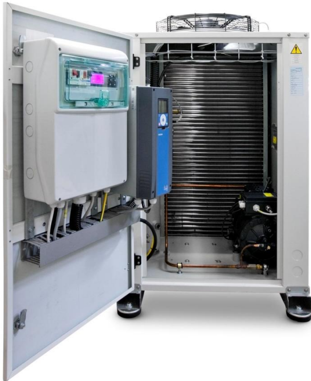
3-10 kW with CO2 MT or LT, single temperature Single compressor units