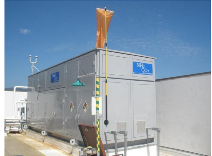
NH3/CO2 System in California: 2012