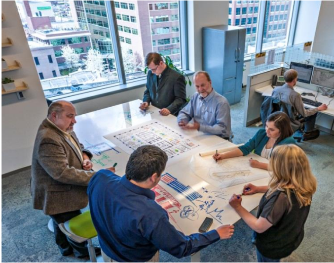
Vision & Collaboration