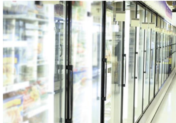
Light Commercial | 轻型商用