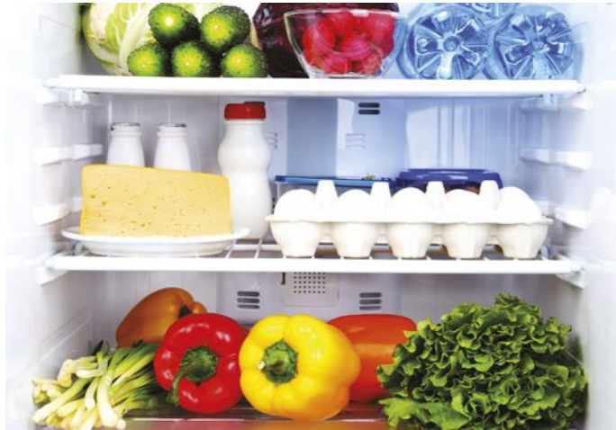
Household | 家用