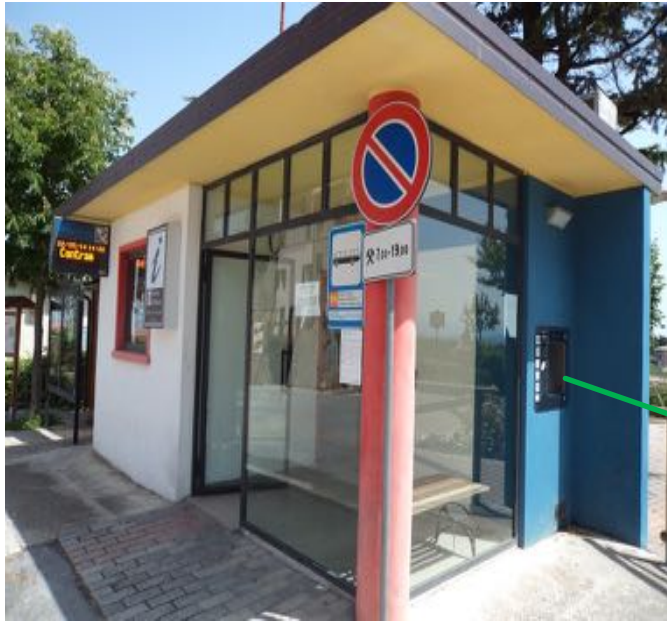
Installation of CITY WALL at the Info point of Pollenza (Italy)